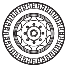
EARLY WAR-TIME FRONT WHEEL